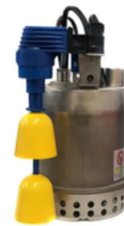
Ball Float (W-VBP)