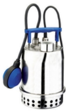
Cable Float (MA)