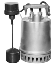
Ball Float (ML)