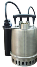
Fixed Float (MS)